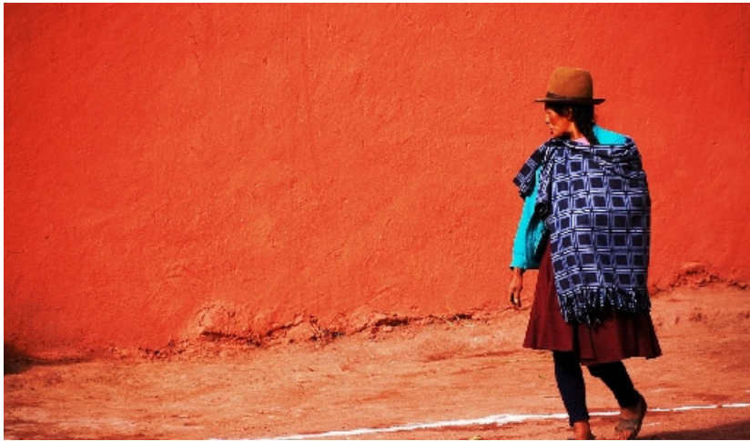
A Quechua woman takes an afternoon stroll

Destinations Tour Type Our Experts Photo Gallery Travel Gear Blog 877-338-8687